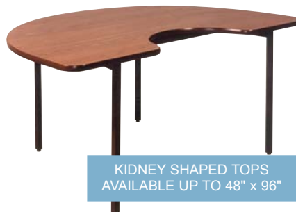
KIDNEY SHAPED TOPS AVAILABLE UP TO 48" x 96"

Rounds and Trapezoids work well in those small niche areas and in libraries.