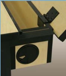
5-Knuckle Hinge w/ Hospital Tip