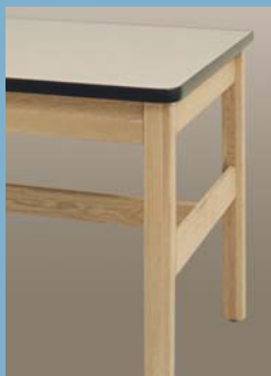
H Brace Art Tables