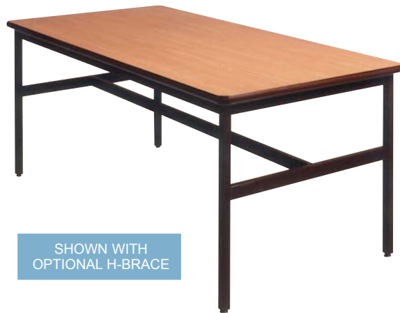
SHOWN WITH OPTIONAL H-BRACE