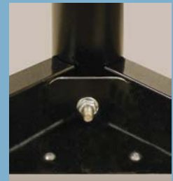
Glacier Bolt Detail