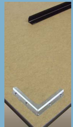
Standard Spanner Bar on Tables over 60"