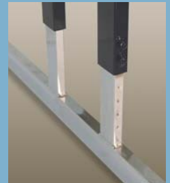
PB Adjustable Leg