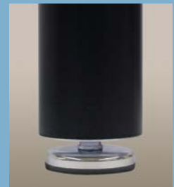
Adjustable Glide Provides 1" of Adjustment