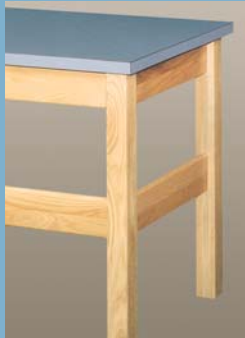
C Brace Science Tables