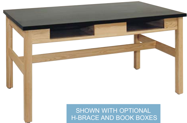
SHOWN WITH OPTIONAL H-BRACE AND BOOK BOXES

Science Tables are available with optional Book Boxes or Drawers and Leg Boots. Other options include H-braces and C-braces for added stability.