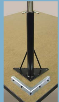
Quick Mount Leg Black/Chrome

The 60" x 60" Horseshoe table is featured to the left. Ironwood also offers a 60" x 66" top for additional workspace.