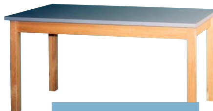
SHOWN WITH 3MM PVC

Ironwood Manufacturing offers many edge options including 3mm PVC, Solid Oak, Vinyl Bull Nose and Armor Tuff. (see back page for examples)