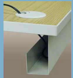
Grommet/ Wire Tray